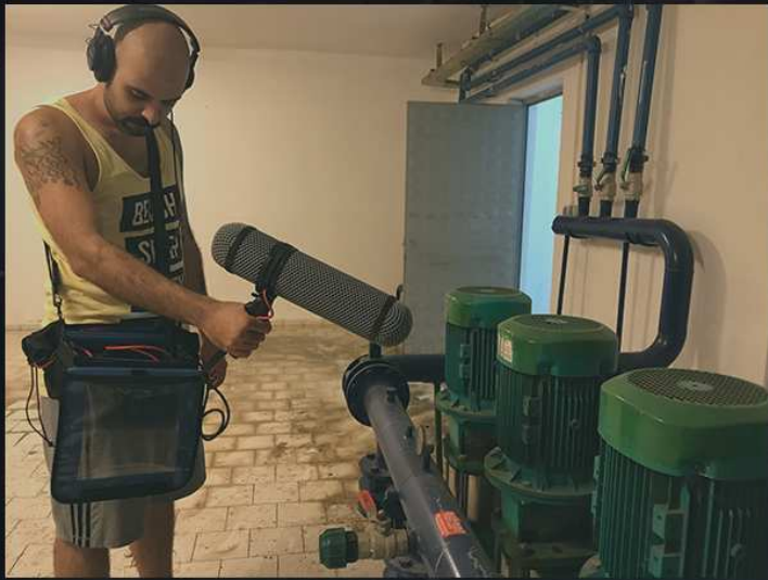
Some shots from our upcoming library ....