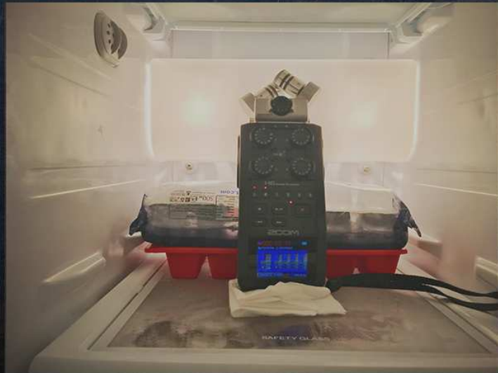
This little man maybe too cold in the fridge but it recorded a perfect sounds!!