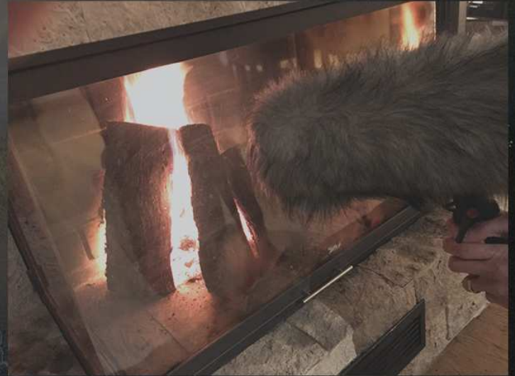
And ice meets fire - the results are surprising!!